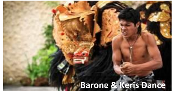
Barong & Keris Dance