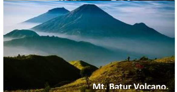
Mt. Batur Volcano.