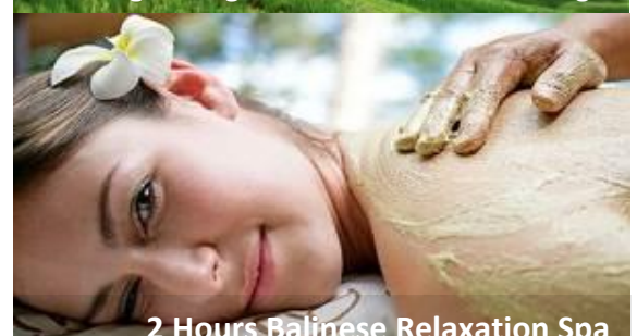
2 Hours Balinese Relaxation Spa