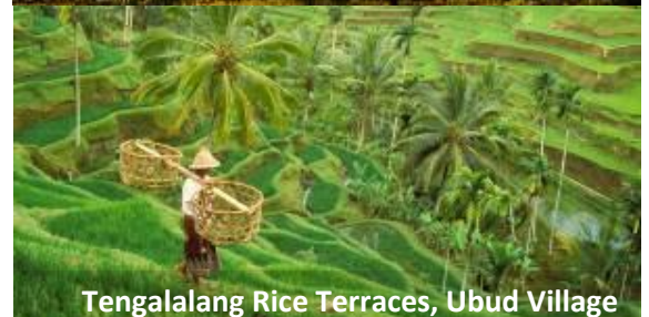
Tengalalang Rice Terraces, Ubud Village