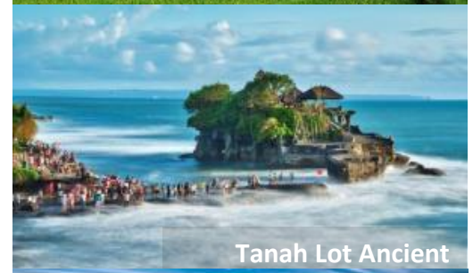
Tanah Lot Ancient