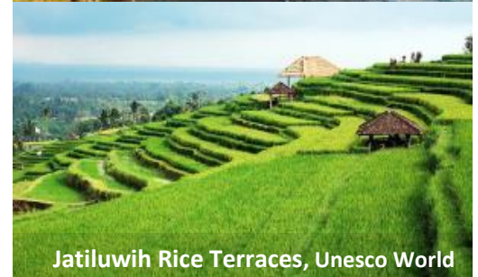
Jatiluwih Rice Terraces, Unesco World