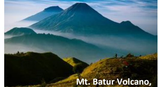
Mt. Batur Volcano,